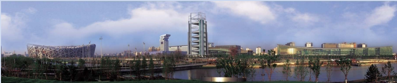
国家体育场 (鸟巢) National Stadium (Bird's Nest)